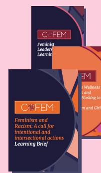
THE LEARNING BRIEF SERIES

We specialize in translating feminist theory into actionable practice. Our aim is to make it easier for stakeholders across the spectrum, from grassroots women's movements to international donors, to apply feminist principles in their work. From training frontline responders in crisis settings to advocating for systemic funding shifts, such as increased funding to women's movements, we are committed to moving the needle on ending violence against women and girls.