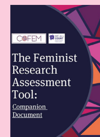
THE FEMINIST RESEARCH ASSESSMENT TOOL