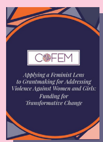
THE HANDBOOK ON FEMINIST GRANTMAKING