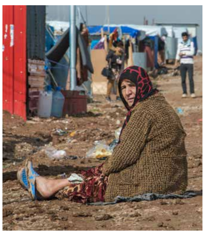
An elderly woman sits outside her tent in Domiz camp, Iraq. (2014)

Not surprisingly, the problems with these parallel coordination systems had a direct impact on GBV coordination. The Sexual and Gender Based Violence Sub-Working Group (SGBV SWG) in Erbil led by UNHCR was already activated for the Syria regional crisis before the current crisis in Iraq. In August 2014, a GBV sub-cluster was