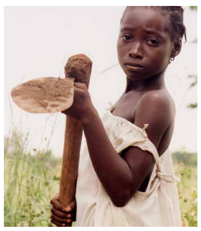
A girl farming with her hoe, Sierra Leone

While many GBV service centres, locally known as Rainbo Centres, also ceased operations during the crisis, a handful did remain open or were able to re-open in new locations, thanks both to a level of flexibility and adaptability the government institutions did not have, as well as funding from the IRC.<sup>101</sup> Especially at the height of the crisis, these centres saw an increase in the number of women and girls coming to them for health services, counselling and case management: between June and December 2014, there was a 19% increase in the number of women and girls attending the Rainbo Centres of Freetown and Kono,