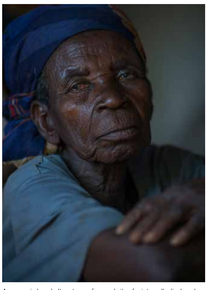
A woman in her shelter at one of several sites for internally displaced people in Kaga Bandoro, Central African Republic (2014)

-JUSTINE GREENING, UK SECRETARY OF STATE FOR INTERNATIONAL DEVELOPMENT, NOVEMBER 2013