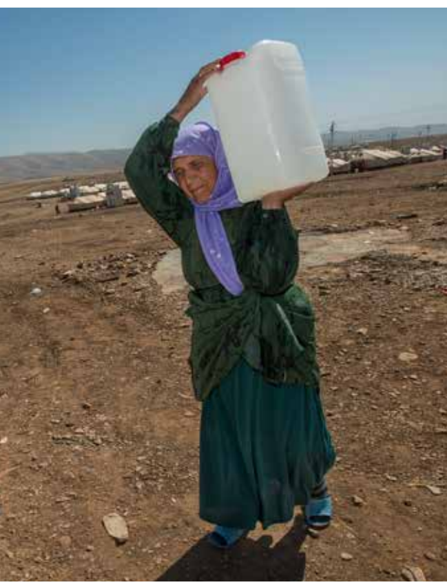
An elderly woman brings water to her tent from an IRC-installed tap in Arbat, Iraq (2013)

All case studies demonstrate lack of action from humanitarian actors beyond the Protection and GBV sectors to reduce risks for women and girls. They highlight examples of actors' limited response to identified GBV protection gaps within the purview of their sector - e.g., putting locks on sanitation facilities to increase women's and girls' safety or ensuring safe